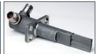
» Temperature Sensors