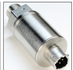
» Pressure Transducers

This list is representative. For a complete list of Ametek Aerospace & Defense products, please contact Kellstrom Defense at sales@kellstromdefense.com or +1.954.538.2000