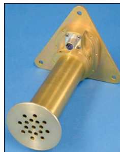
» Fuel Quantity Probes