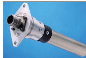
» Liquid Level Sensors