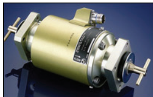
» Fuel Flow Transmitters